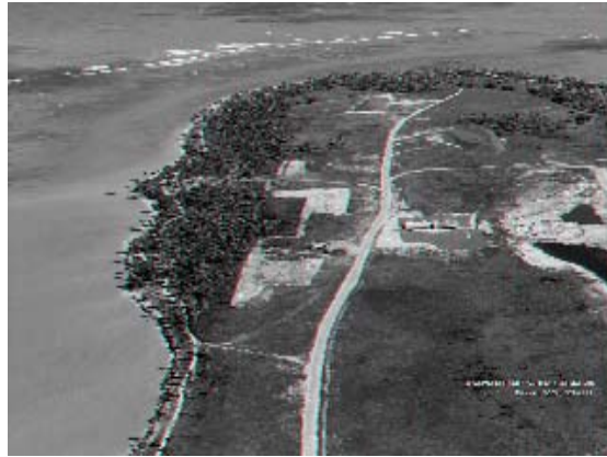
(Figure 1. Areal view of the site)

Typically, the uppermost sand layer is about 1.2 mt thick (4 ft) and shows average N-values of 10 to 20 blows/ft. The loose sand and soft sandy silt, underlie the relatively clean sands to an approximate depth of 9.1 mts (30 ft). Most of the N-values in these soils ranged from 0 (weight of hammer) to 4 blows/ft. Natural moisture contents varied between 22% and 78%.