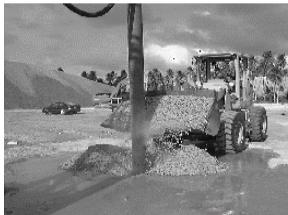
(Figure 2. Installation of the stone columns)

The process of backfilling and compaction by vibration continued until dense stone columns, some 1.1 to 1.2 mt in diameter, reach the surface.